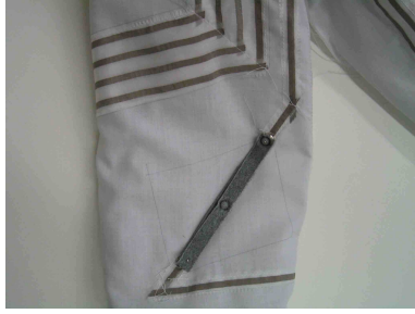
Figure 3. Stretch sensor with fabric bus.

We did not wish to use additional devices for our gesture sensing and thus explored the potential of tuning the QProx IC, however we were unable to achieve satisfactory results in the time available and thus turned to electrical skin resistance measurement as an alternative approach.