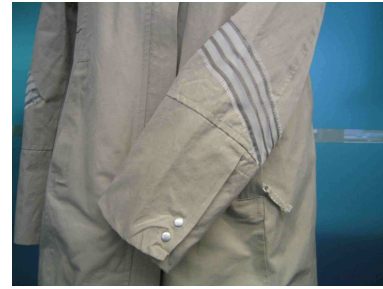
Figure 2. Striped fabric touch sensor.