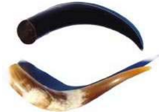
Figure 1. Original horns used as inspiration for the design concept

However, horns such as these were not large enough to house the envisaged technology. In earlier trials we observed children's fascination for novel technology and believed that a technically overt design would be more engaging.