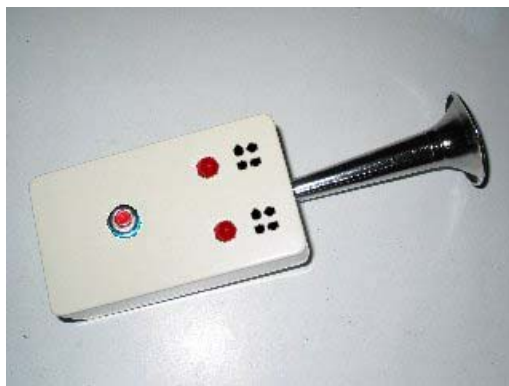
Figure 2. The Box Horn prototype

We wished to retain the organic element of the natural horn and at the same time introduce an obvious technological component. The first prototype we built was the Box-Horn ('box+horn'), attempting both to echo the organic shape of the natural horn, and at the same time provide an interesting technical object. An MP3 player was mounted inside the white box, two red Light Emitting Diodes (LEDs) flash when a location ping is received by the horn and the sound is played through the metal horn by operating a push button (figure 2).