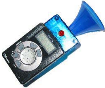
Figure 3. The Techno Horn prototype

visible 'techy' solution with the possibility that the children could operate the player themselves as well as having sounds automatically cued. The horn itself was again used as a speaker housing.