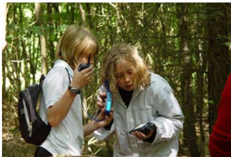
Figure 4: Using the horn to listen to sounds

The children intuitively interacted with the horn itself in a variety of ways. Some pairs of children held it to their ear to listen to the sound as might be expected. In these instances they took it in turn to listen to the sound, with sometimes one child holding it for the other child to hear. Other pairs chose not to hold the horn to their ear, but held it in front of them, enabling both children to listen at the same time. The design allowed children to collaboratively engage with the device and encouraged good sharing practice (figure 4). The horn was also used well in conjunction with the other devices the children had. The facility to hang it around the neck left their hands free for other devices, such as PDA and walkie-talkies, and its shape and size enabled easy grasping in one hand, allowing easy transferring between children.